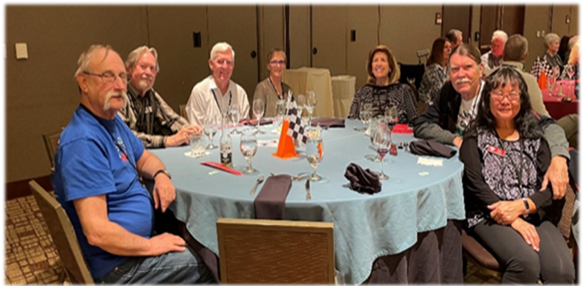
CCA Gang at the Saturday Night Dinner at the Isleta Resort

There were 105 attendees who enjoyed a variety of activities including museum visits, historic sites, and local shopping. The weather didn't cooperate but the organizers were able to make adjustments on the fly.