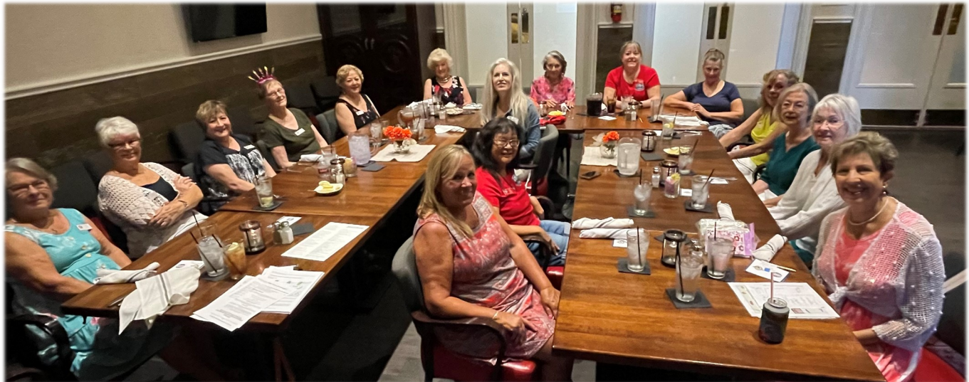
August Chicks and Roosters Luncheon →