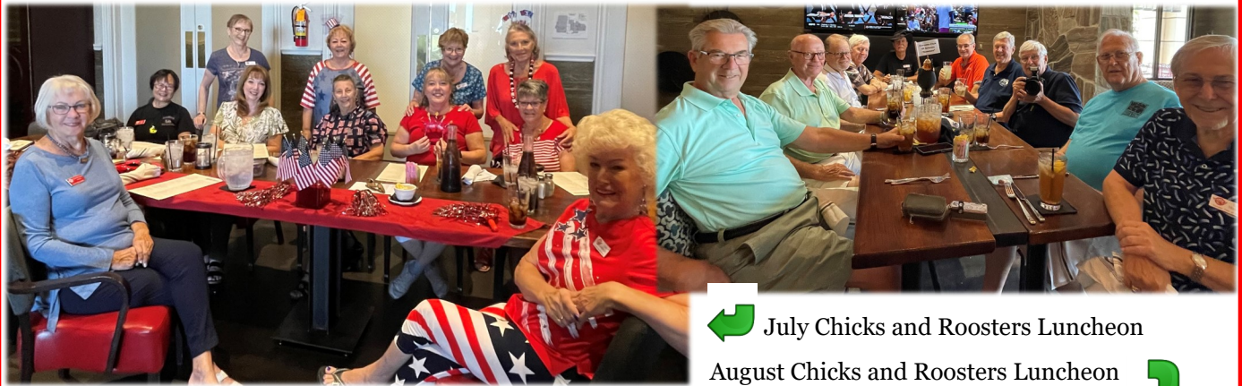
← July Chicks and Roosters Luncheon