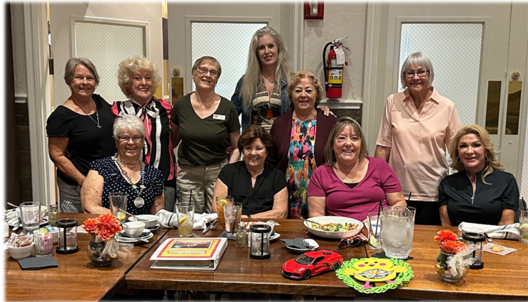
September's Chicks Lunch