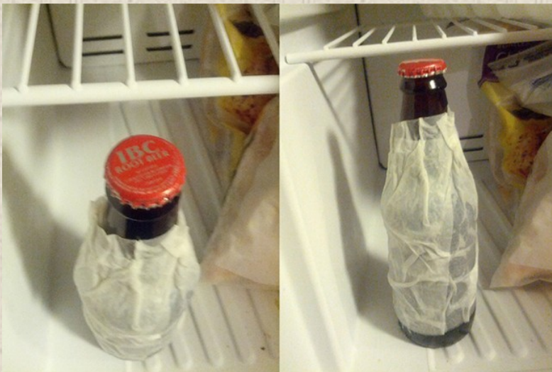
Wrap a wet paper towel around beer, and put it in the freezer to cool in just 2 minutes