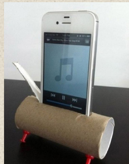
Quick and Easy Smartphone Speaker