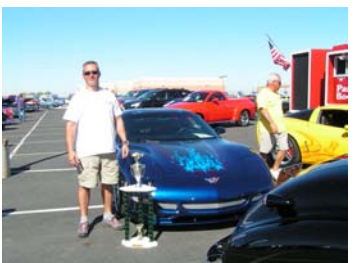
Best of Show-Corvette Angelo Fornado '04 C-5