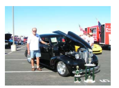
Best of Show-Chevy Best Interior Manfred Wagner '39 Chevy Coupe