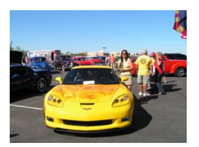
Best Paint Sandy Wolf '06 C-6

As I look at the sign up sheet at the list of volunteers, it just about covers the entire club.