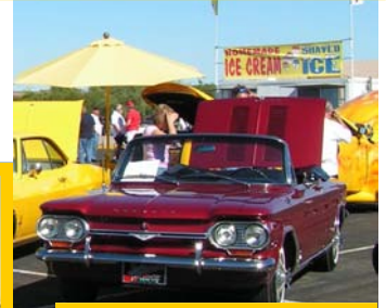
Bill Rhode 1st Place Corvair