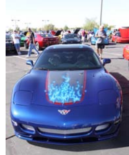
Angelo Fornaro Best Paint